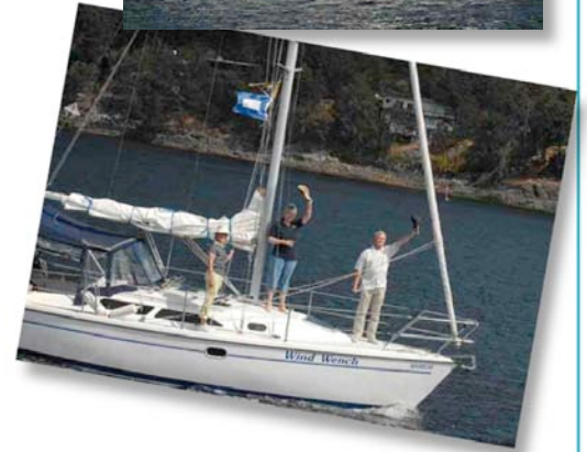
Dreki (top) and Wind Wench salute Tall Ships in Maple Bay.