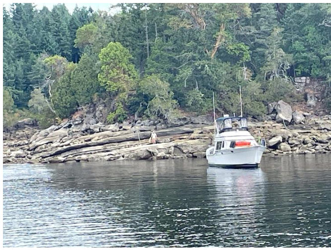
Bute Island Regional Park with boat using newly installed stern tie